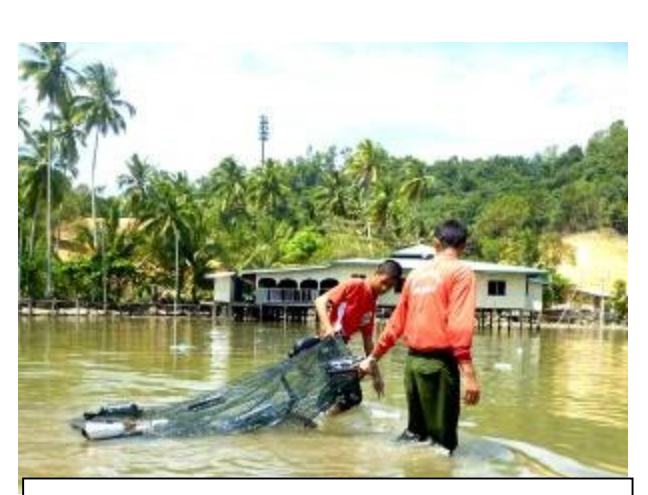
The Rubbish Nett mechanism can be improve to make it more user friendly, for example attaching it to a boat so the students will not have to pull it in the water

The rubbish net is very useful to help clean the area