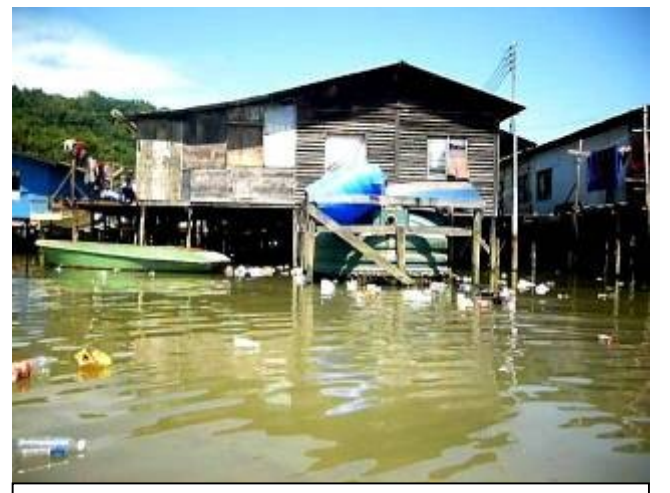
LITTERS AT KG NUMBAK FROM WHERE OUR STUDENTS HAILS