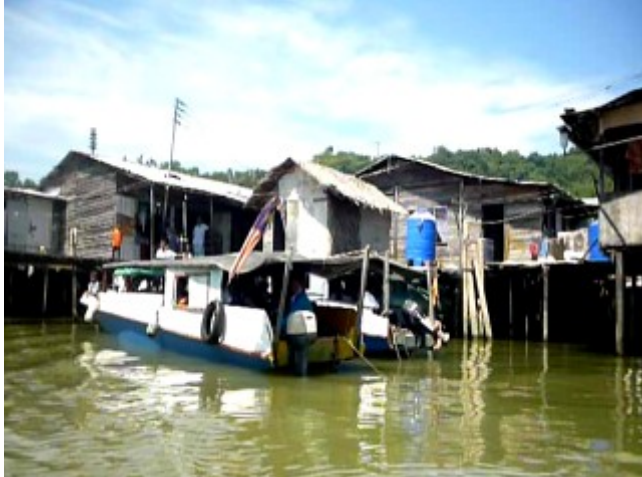
THE MAIN TRANSPORTATION MODE OF THE STUDENTS TO SCHOOL