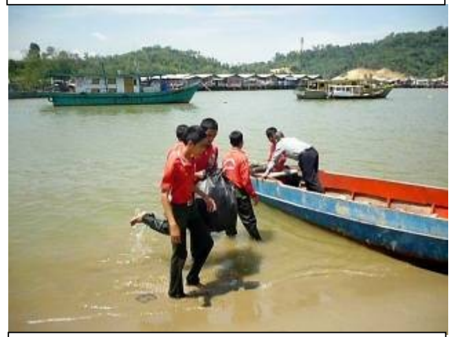
The group of students